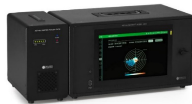
The Magee Scientific Aethalometer® model AE43

Aerosol d.o.o. Kamniška 39 A SI-1000 Ljubljana Slovenia +386 1 439 1700